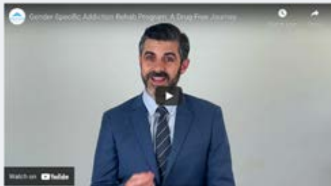
Click image for link to video.

hospital-based inpatient facility offers around-the-clock medical care from healthcare professionals and clinicians. Other inpatient programs in Portland tend to impose strict, senseless restrictions that actually inhibit growth, but at Crestview, we believe that learning how to manage freedom is an essential component of lasting recovery. While attending inpatient treatment is not a reasonable option for most people because of work, family, and academic obligations, it is the best way to make a dramatic, lasting life change. Portland non-hospital-based residential programs can also facilitate access to medical services when needed.